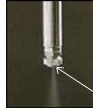
Two-way nozzle system

Easy to take apart for cleaning to prevent contamination