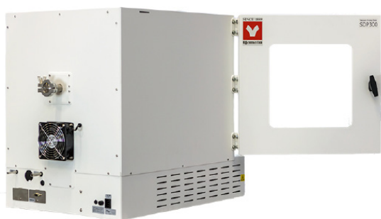
Back view with open door