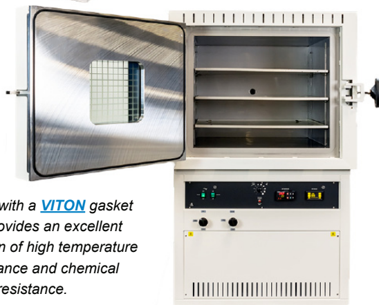
Front view with open door

A secondary independent high limit controller provides overtemperature safety protection.