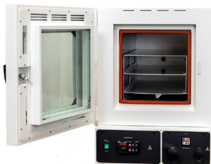
Front view with open door